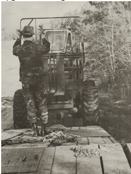
80 APS member guiding a 10K All Terrain forklift unto a trailer.

From 29 July to 12 August twenty-two personnel performed two weeks annual tour at Dover AFB, DE. While there they participated in the bases ORI and were converted to 12-hour shifts. During the other UTAs in August and September the unit was mainly involved with MHE and upgrade training. 1978