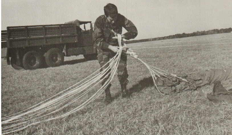
80 APS member recovering a bundle