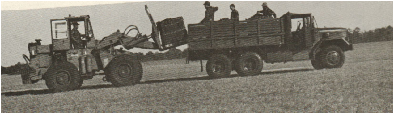
80 APS personnel loading a CDS unto a Deuce and Half.

A mobility exercise was conducted 13 April and 28 April 1984 at Dobbins AFB. All Wing units at Dobbins (with the exception of the 79 APS and 80 MAPS) were tasked for the April 13th exercise, with 3U9 members and 45,158 pounds of cargo scheduled to be processed. The 79th and 80th were not involved as they did not pull their UTA with us that weekend. They were, however, involved during the 28th exercise, during which 77 persons were processed with 15 of the 80 MAPS members actually deploying to Panama. The exercise was for personnel processing only; no equipment was tasked.